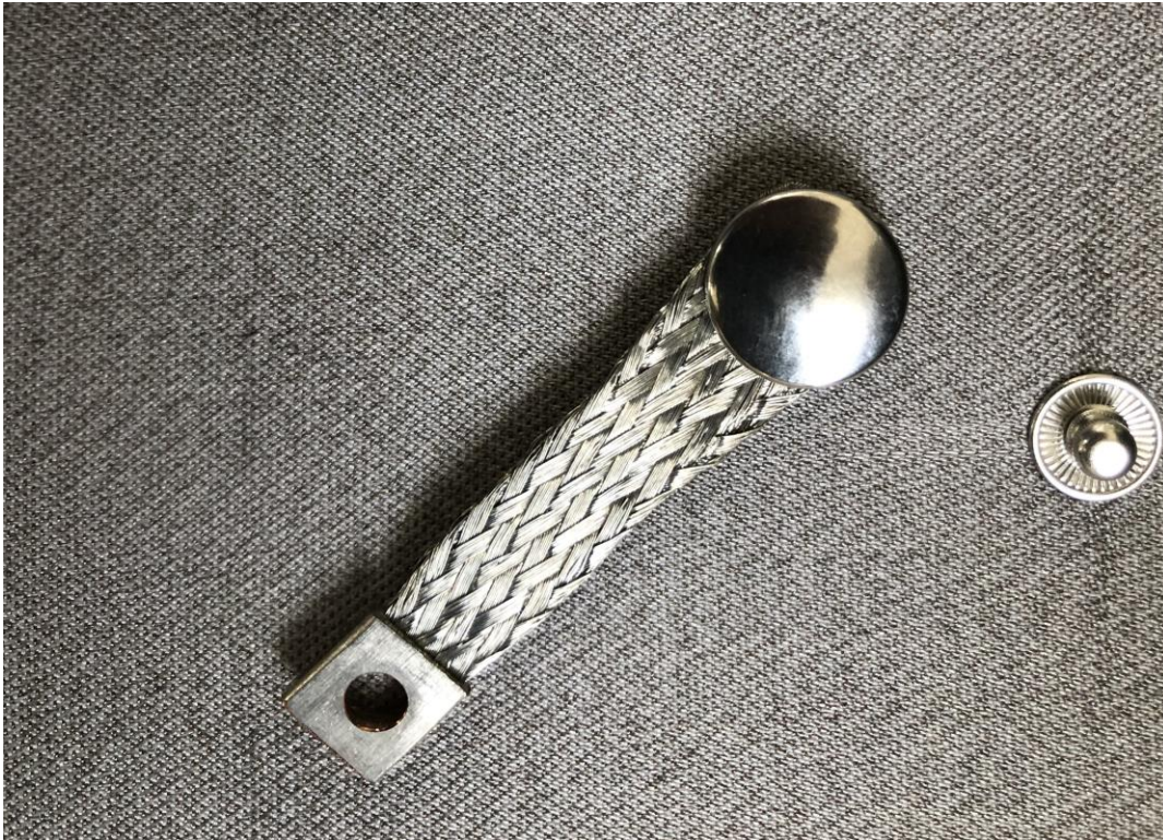
Picture 3: using textile rivets to establish electrical contact to the ground plane