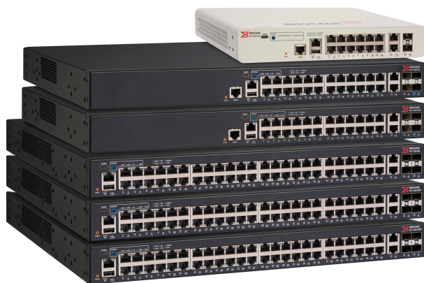
Figure 1. Brocade ICX 7150 Switch models.

Brocade ICX 7150-48PF Switch 48×10/100/1000 Mbps RJ-45 PoE+ ports 740 W PoE budget 2×10/100/1000 Mbps uplink RJ-45 ports 4×1/10 GbE uplink/stacking SFP/SFP+ ports