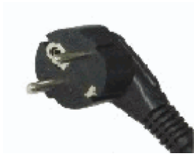
DIN49441 16A plug