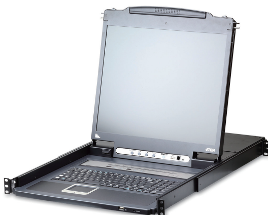
CL5716I Rear View