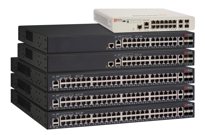
Figure 1. Brocade ICX 7150 Switch models.

4×1/10 GbE uplink/stacking SFP/SFP+ ports