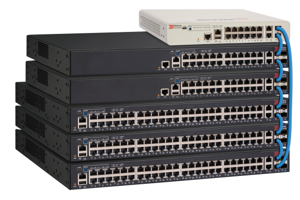
Figure 3. Up to eight Brocade ICX 7150 switches can be stacked together into a single logical switch using standard SFP+ 10 Gbps ports and copper cables or optics.