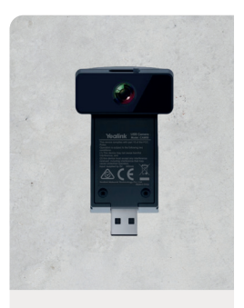
USB CAMERA 1120105