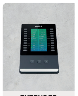
EXTENDER MODULE 91378363