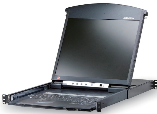
● KL1516Ai Front view