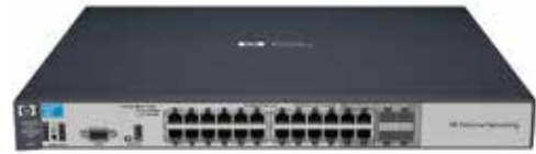
HP 3500-24 Switch (J9470A)