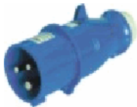
IEC60309 plug (32A 2P+E)